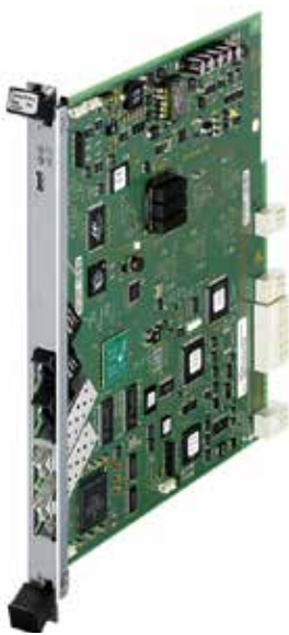
Core unit COGE6