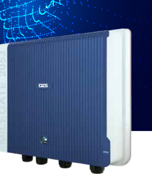
MileGate 205x G.fast DPU (Distribution Point Unit)

Distribution Point Unit (DPU) for ultra-high-speed FTTB applications with support of G.fast 212 Mhz