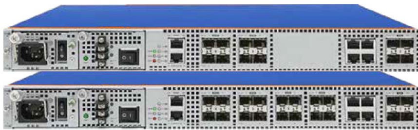
DZS V5808 (top) and V5816 (bottom)

Mini GPON OLTs for small passive optical networks