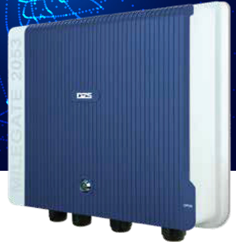
MileGate 205x G.fast DPU (Distribution Point Unit)