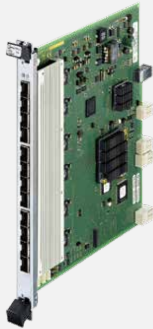
Optical Ethernet line card SUE12

High density Ethernet line card for business services and advanced IP applications