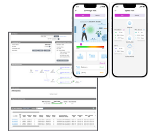
Espresso & CloudCheck